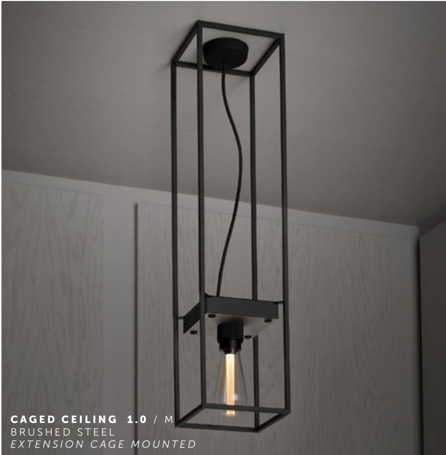
CAGED CEILING 1.0 / M BRUSHED STEEL EXTENSION CAGE MOUNTED