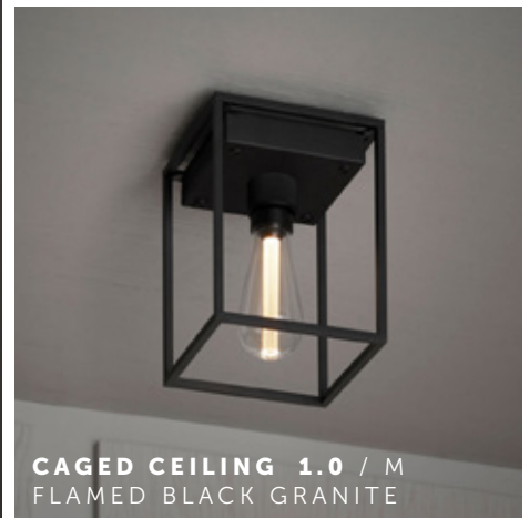
CAGED CEILING 1.0 / M FLAMED BLACK GRANITE