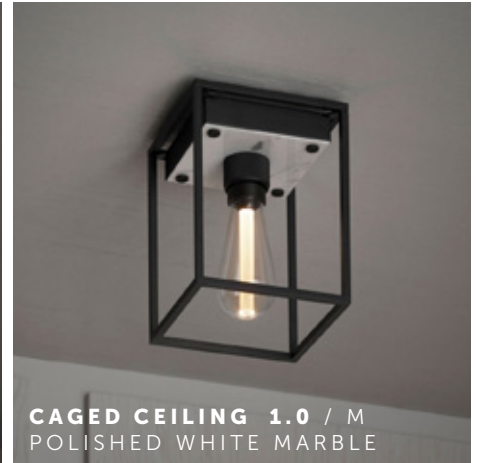
CAGED CEILING 1.0 / M POLISHED WHITE MARBLE